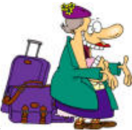
AUNT - tia